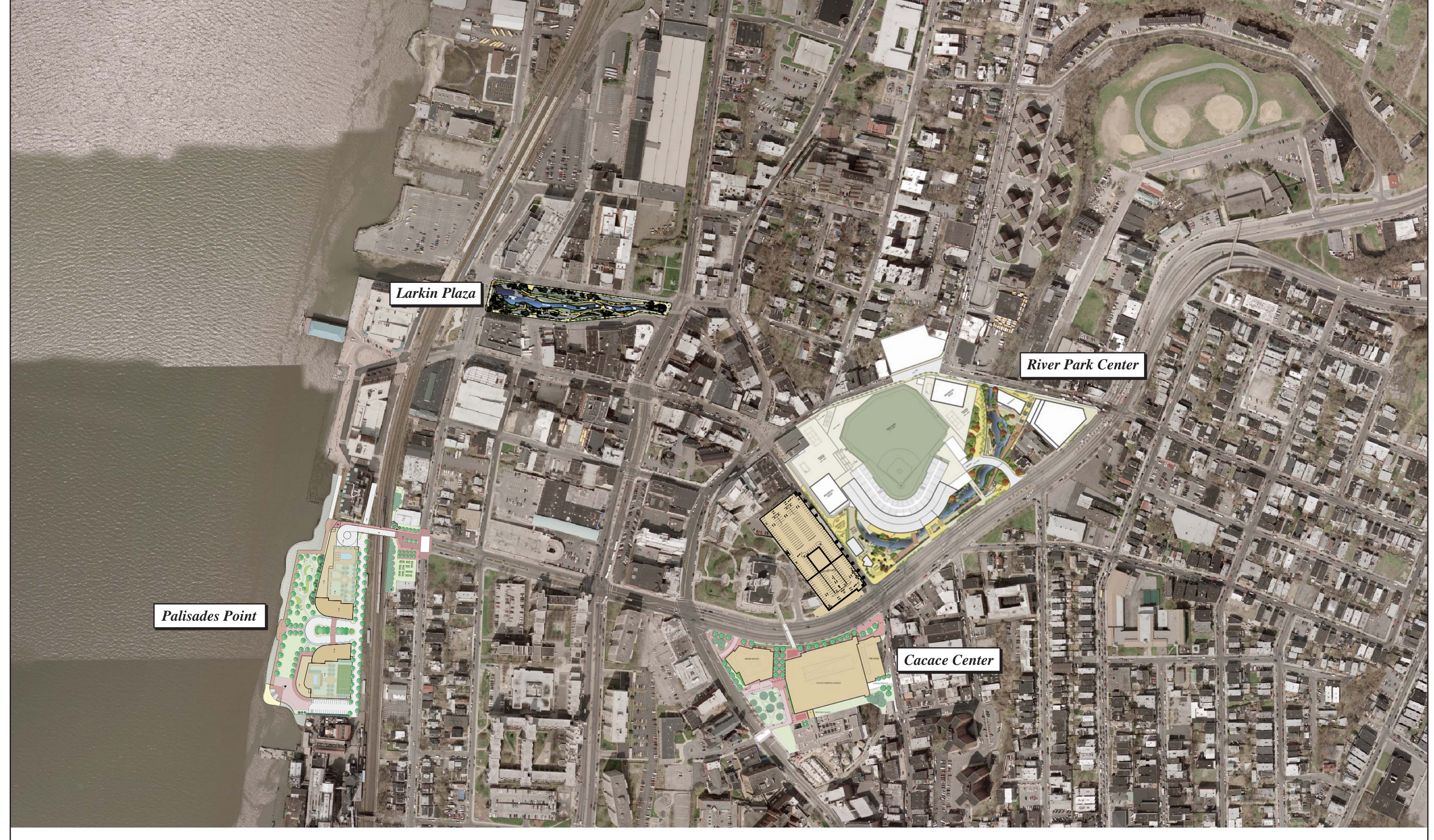
Exhibit I-2 COMPOSITE SITE PLAN